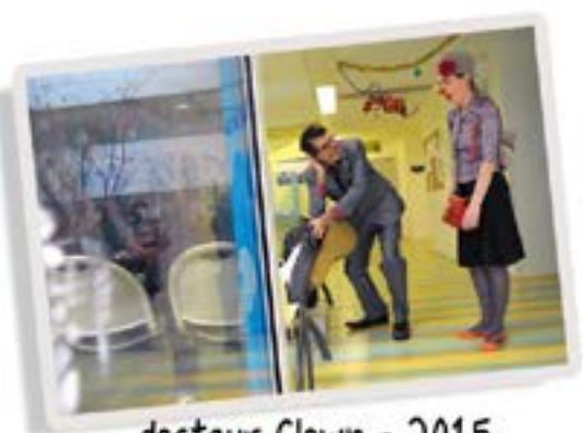
docteur Clown - 2015